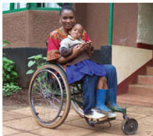
Africa Wheelchair Fund: Quality of Life

Imagine that instead of giving the usual socks, photo frames and novelty ties on special occasions, you were able to give a disabled person in Africa a wheelchair – the catalyst to an improved quality of life? Commemorating a birthday, graduation or engagement with a donation to the Africa Wheelchair Fund is a really meaningful gift and will ensure that people are not denied mobility because they are poor. £120 will buy a wheelchair, but any donation will help. And if you would like your family and friends to contribute to this fund in lieu of presents for you, please ask them to mark their cheques for the African Wheelchair Fund – and to let us know what you are celebrating! Thank you.