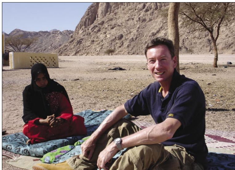
Frank Gardner tells us why he was 'Motivated to Travel'.