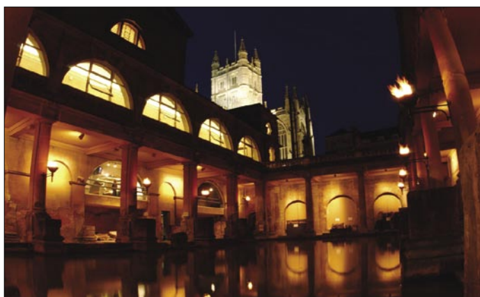
Join us in Bath for the Motivation Ball.