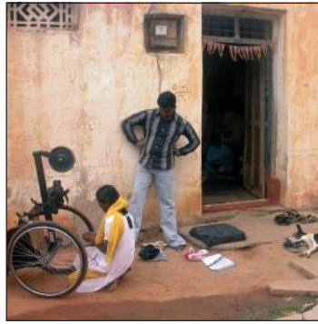
Local staff adjusting one of Motivation's Worldmade Rough Terrain wheelchairs on a rural follow up visit in India. Worldmade wheelchairs will be key to developing our work in India to address the huge need for appropriate wheelchairs across the country.

362 community workers received disability awareness training, ensuring that they will continue to refer disabled children to the local organisations.