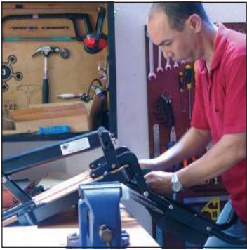
A member of staff from the International Committee of the Red Cross takes part in Motivation's Wheelchair and Postural Support Training course.