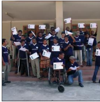
Participants in referral network training in East Timor were proud to be awarded their certificates on passing the course, marking the beginning of developing their national network of wheelchair provision.