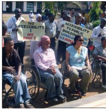
In 2007 Motivation employees and Africa partners supported and participated in the 4th All Africa Wheelchair Congress in Tanzania. During the congress participants took to the streets of Moshi to campaign for the rights of disabled people.