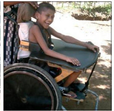
A young boy in Sri Lanka is able to enjoy communicating with others in his supportive seating wheelchair, fitted to his complex postural support needs as a result of the Community Based Supportive Seating Programme.